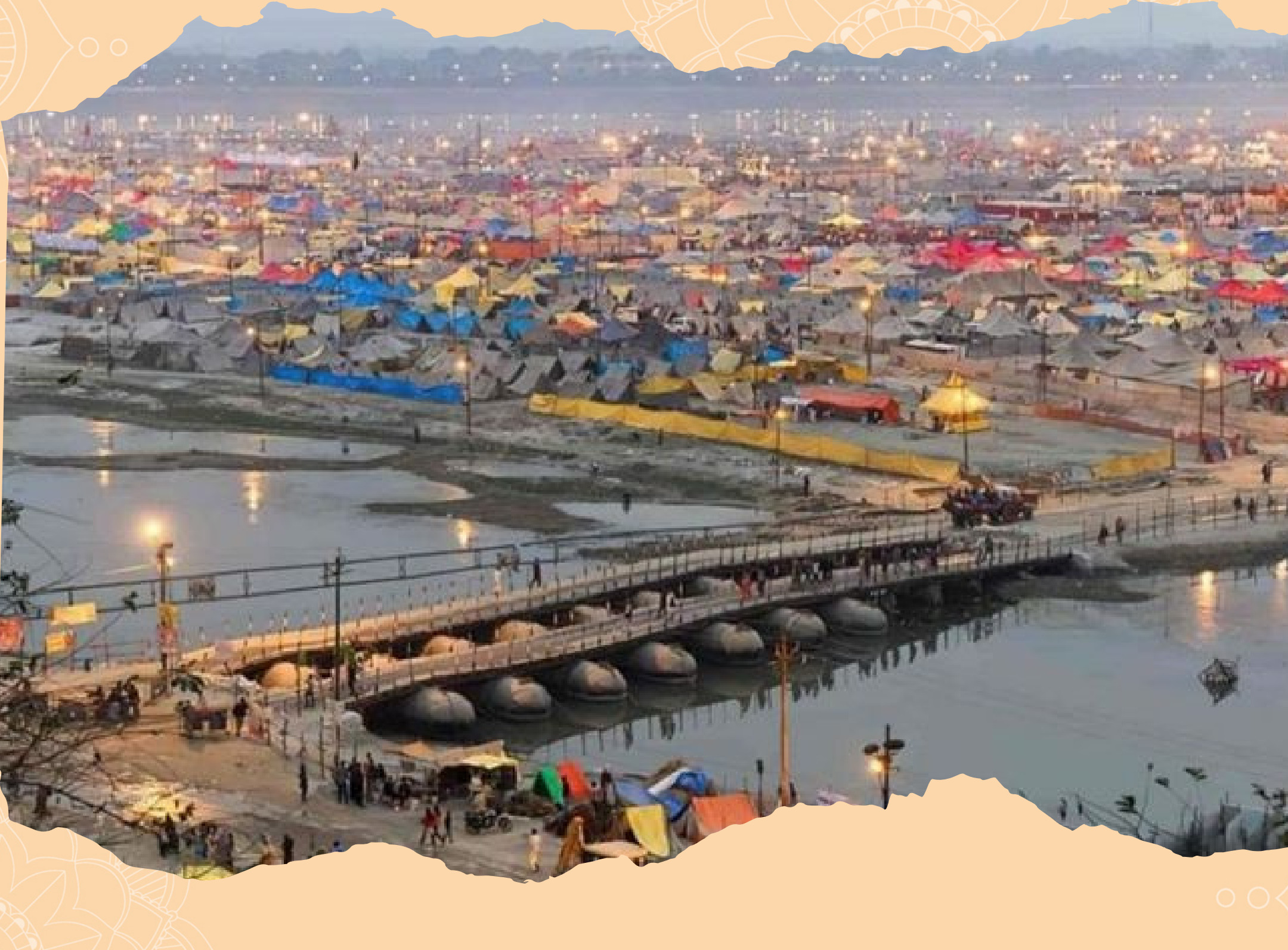
Day 3: Varanasi to Prayagraj: Triveni darshan and Temple tour & Sightseeing (125 km / 3 hrs)