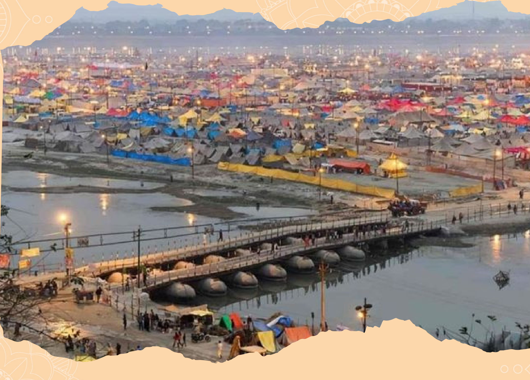
Day 3: Varanasi to Chitrakoot with Completing sightseeing of Prayagraj: Triveni darshan and Temple tour & Sightseeing (250 km / 6 hrs)