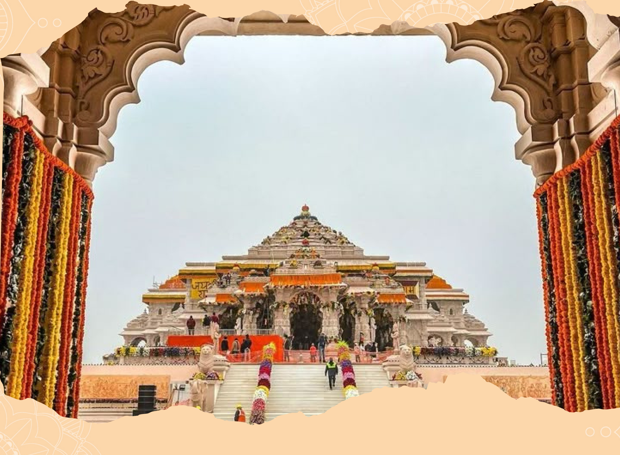
Day 5: Lucknow to Ayodhya with Naimisaranya tirth: Ram Mandir Darshan and Sarayu aarti | Temple Tours (230 km / 6 hrs)