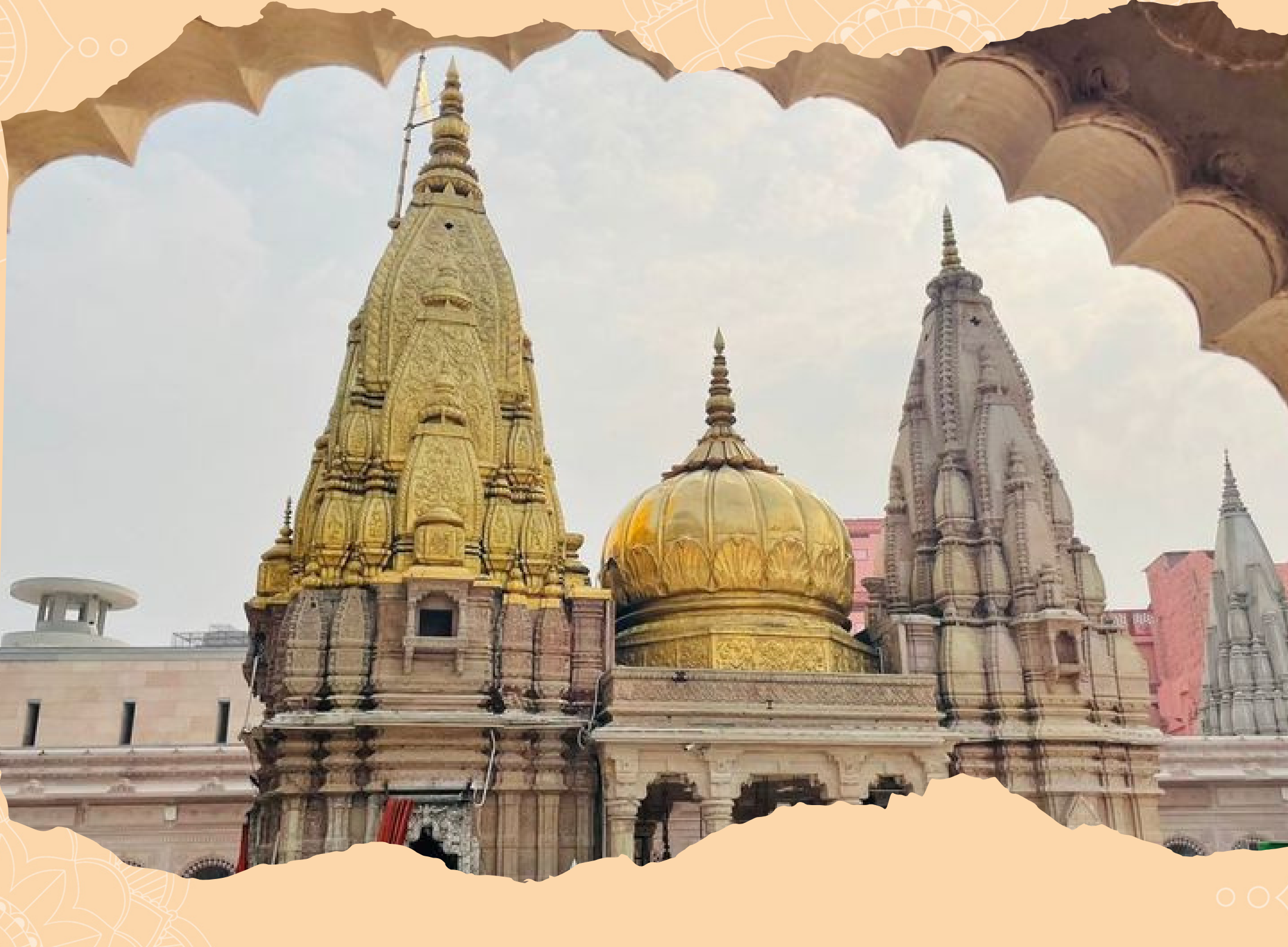
Day 2: Varanasi Full Day Sightseeing: Kashi Vishwanath Temple and Sarnath Sightseeing!!