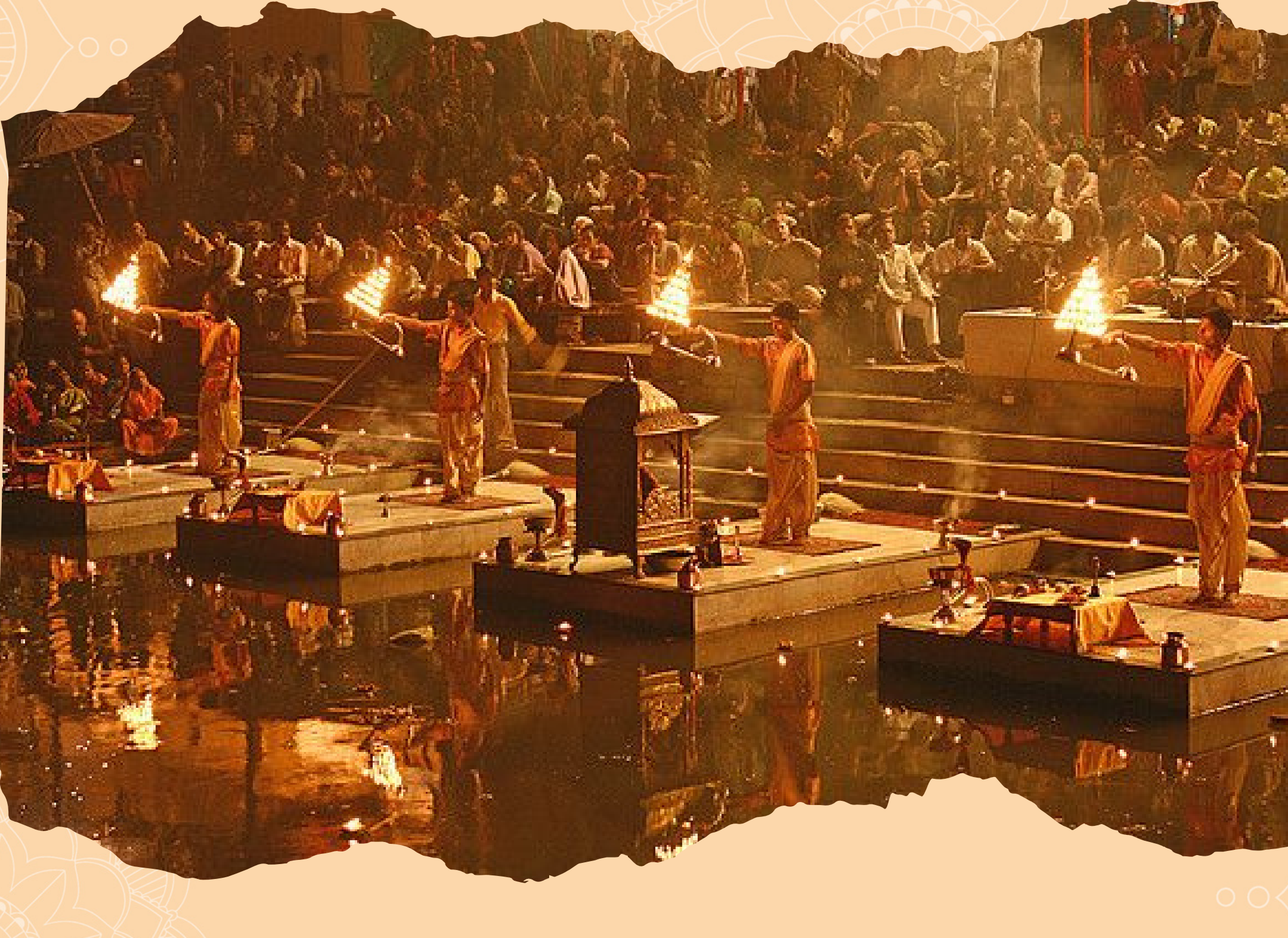
Day 1: Arrival in Varanasi Afternoon: Arrival in Varanasi | Temple Tour & Evening Ganga Aarti!!