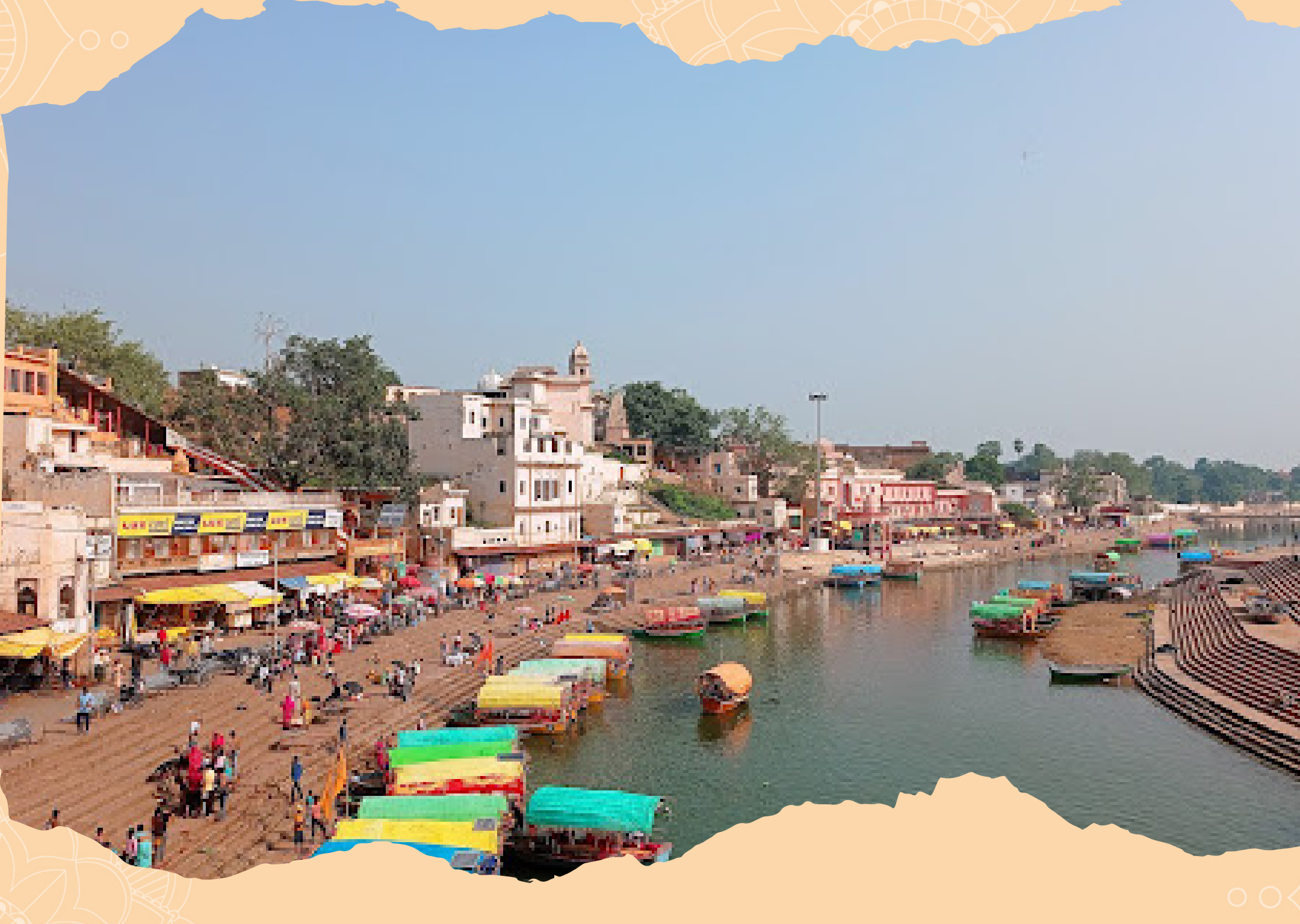
Day 4: Chitrakoot to Lucknow - Sightseeing and Transfer (235 km / 6 hrs)